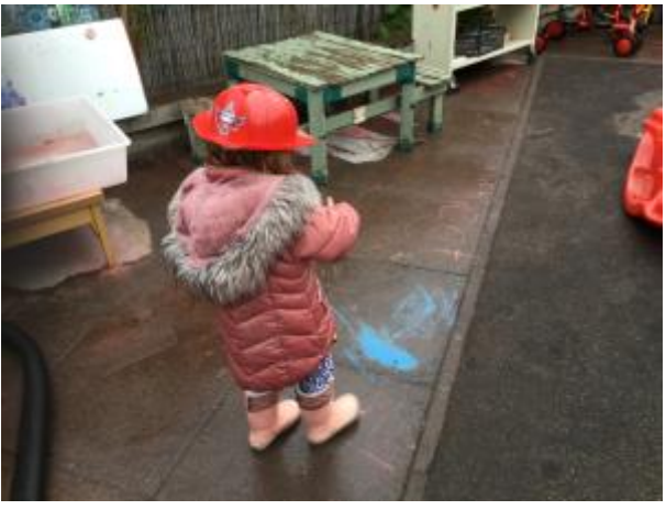
1 - Fire fighter Autumn wont let the rain stop her.