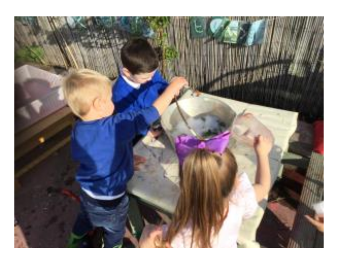
{\it 5-Three\ brilliant\ chefs\ making\ soup\ together!}