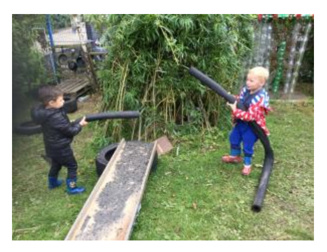
3 - "Oh no the Den is on fire, quick put it out!!"