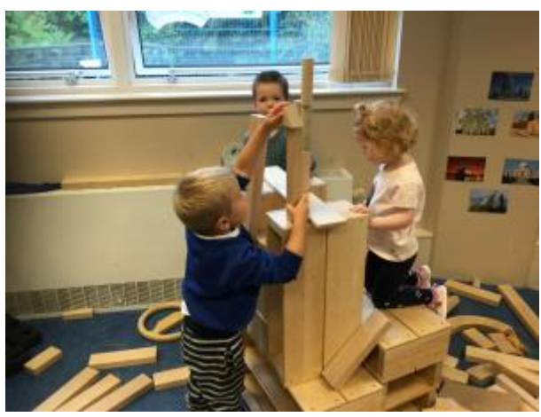
6 - Team work makes the dream work